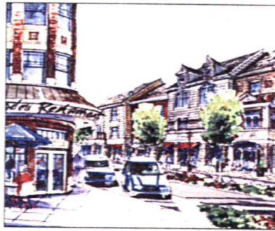
West Village is being developed in the Vinings submarket of Atlanta near Interstate 285 and Atlanta Road.

A joint venture between The Highlands Companies, The Pacific Group and Branch Properties is developing West Village, a new mixed-use development situated on 50 acres near Interstate 285 and Atlanta Road in Atlanta's Vinings submarket. Each company is developing specific components of the $300 million project, which is one of the largest live/work/play developments underway in the metro Atlanta area.